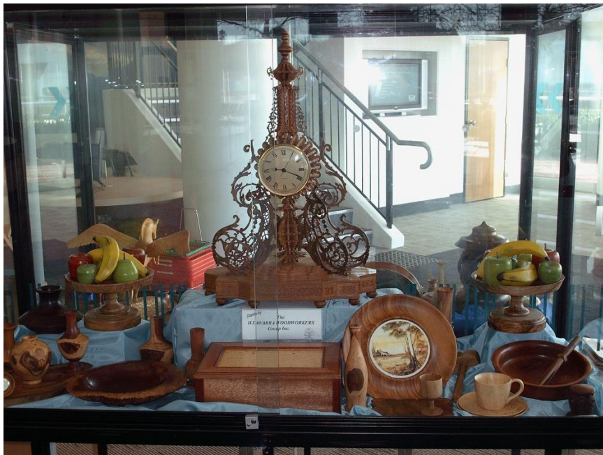
A display in the Wollongong library, 2008.