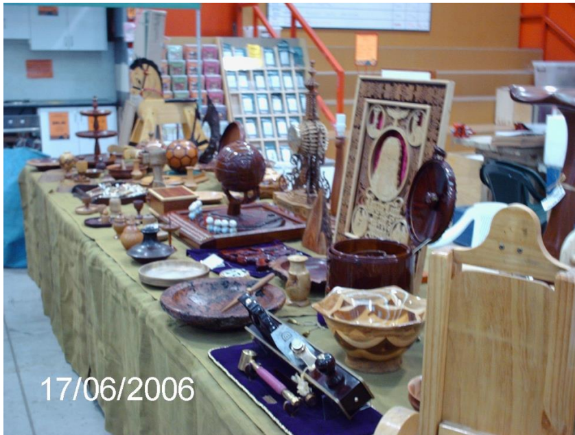
Display at Bunnings, in 2006