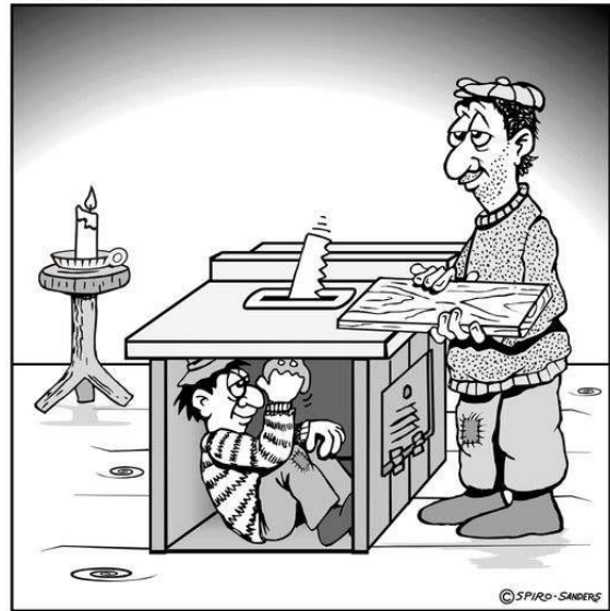
Early attempts at the table saw.