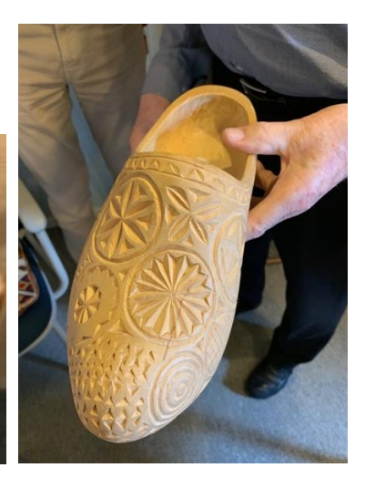
TOOLS: These two below are the only tools needed for this fine work.